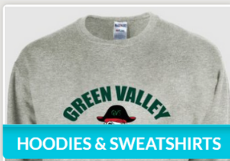
HOODIES & SWEATSHIRTS