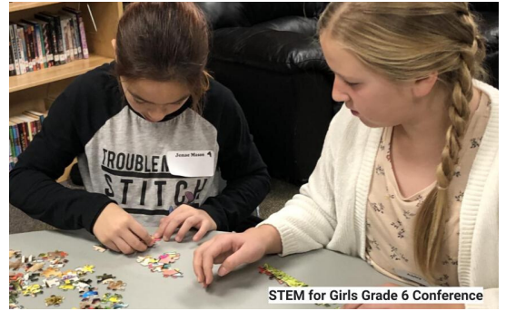
STEM for Girls Grade 6 Conference