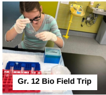
Gr. 12 Bio Field Trip