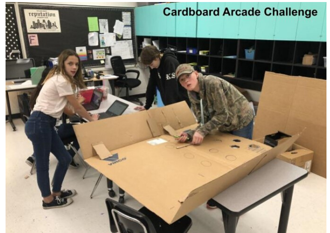
Cardboard Arcade Challenge