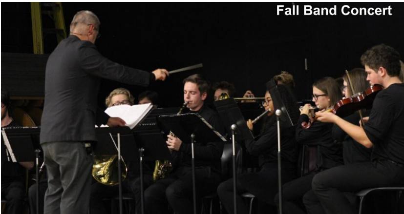
Fall Band Concert