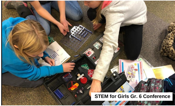
STEM for Girls Gr. 6 Conference