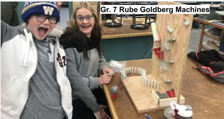
Gr. 7 Rube Goldberg Machines